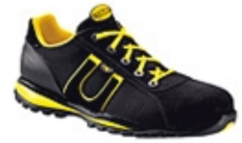
80013 - BLACK