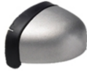
ALUMINIUM TOE CAP 200J