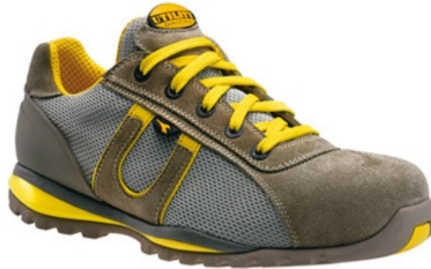
75029 - MOON ROCK