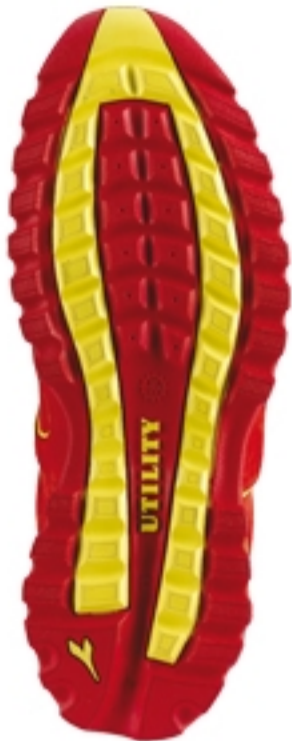
FLARED TO PROVIDE HIGHER COMFORT AND STABILITY